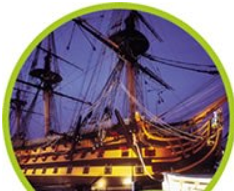
Portsmouth Historic Dockyard

group rates and special charters available